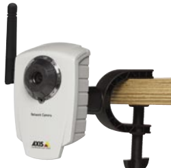
AXIS 207/207W/207MW Network Camera with flexible clamp - clamp included