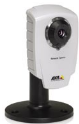
AXIS 207/207W/207MW Network Camera with camera stand - stand included